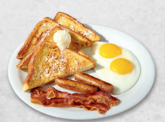
FRENCH TOAST SLAM® Four slices of French Toast served with eggs*, 2 bacon strips, and 2 sausage links. AED 61