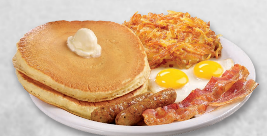
GRAND SLAM® Buttermilk pancakes, eggs*, 2 bacon strips, 2 sausage links, and hash browns. AED 63