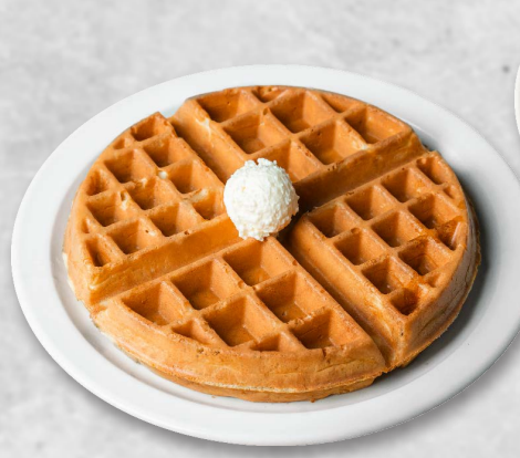
BELGIAN WAFFLE SLAM® Belgian waffle served with eggs*, 2 bacon strips and 2 sausage links. AED 61