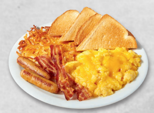
ALL-AMERICAN SLAM® Three scrambled eggs with Cheddar cheese, 2 bacon strips, 2 sausage links, hash browns, and a choice of toast. AED 63