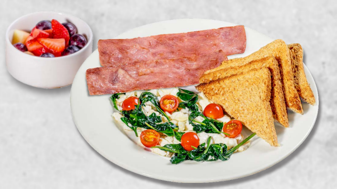
FIT SLAM® Egg whites scrambled together with fresh spinach, cherry tomatoes, turkey bacon strips, and a choice of toast, served with seasonal fruit. AED 59